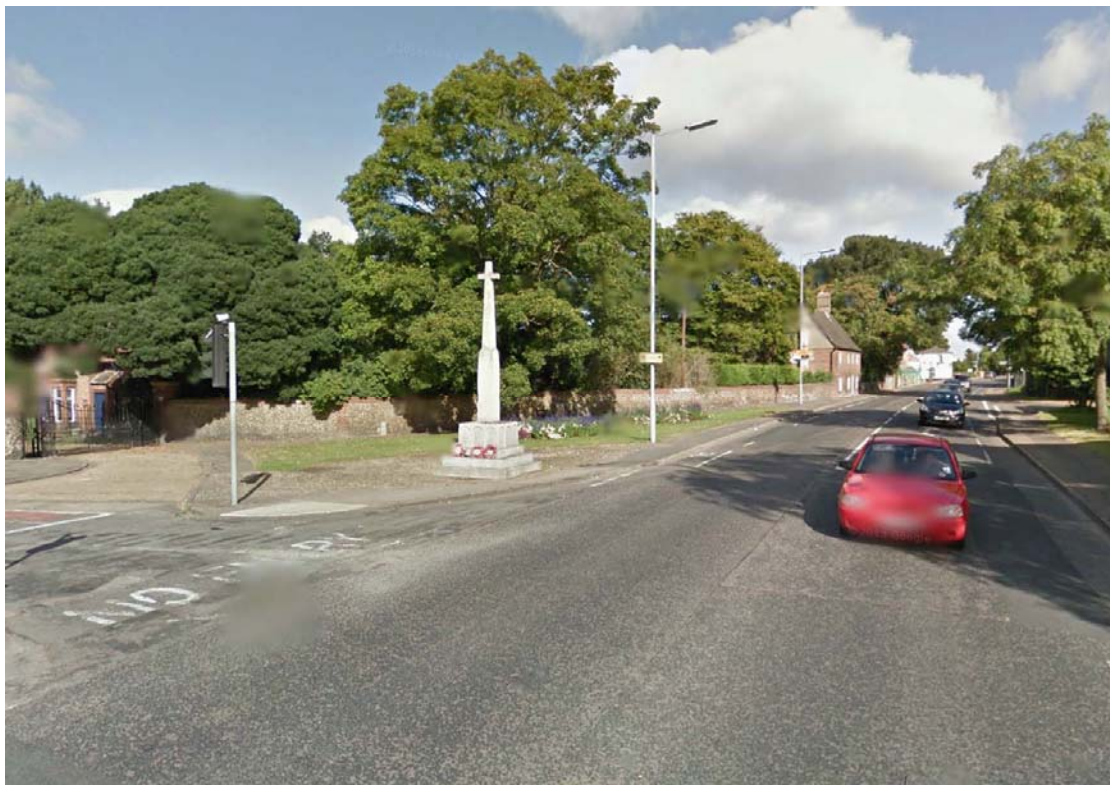
Existing Image 1 – Prominent position of War memorial

The local residents have also been involved with the proposed resurfacing of the area around the base of the memorial for a number of years. They are very keen to improve its accessibility and the drainage around its base. Hopefully they would welcome the use of a quality material in this location.”