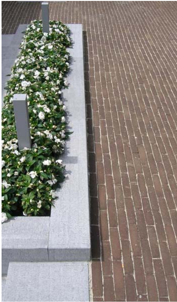
Image 5. Example of Portland stone edging and SeptimA clay pavor